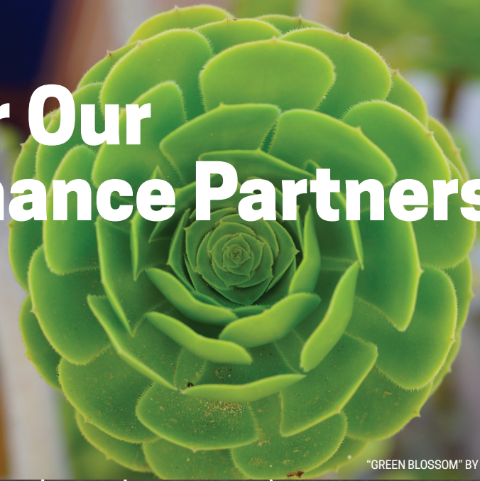
"GREEN BLOSSOM" BY JJMUSGROVE CC BY 2.0